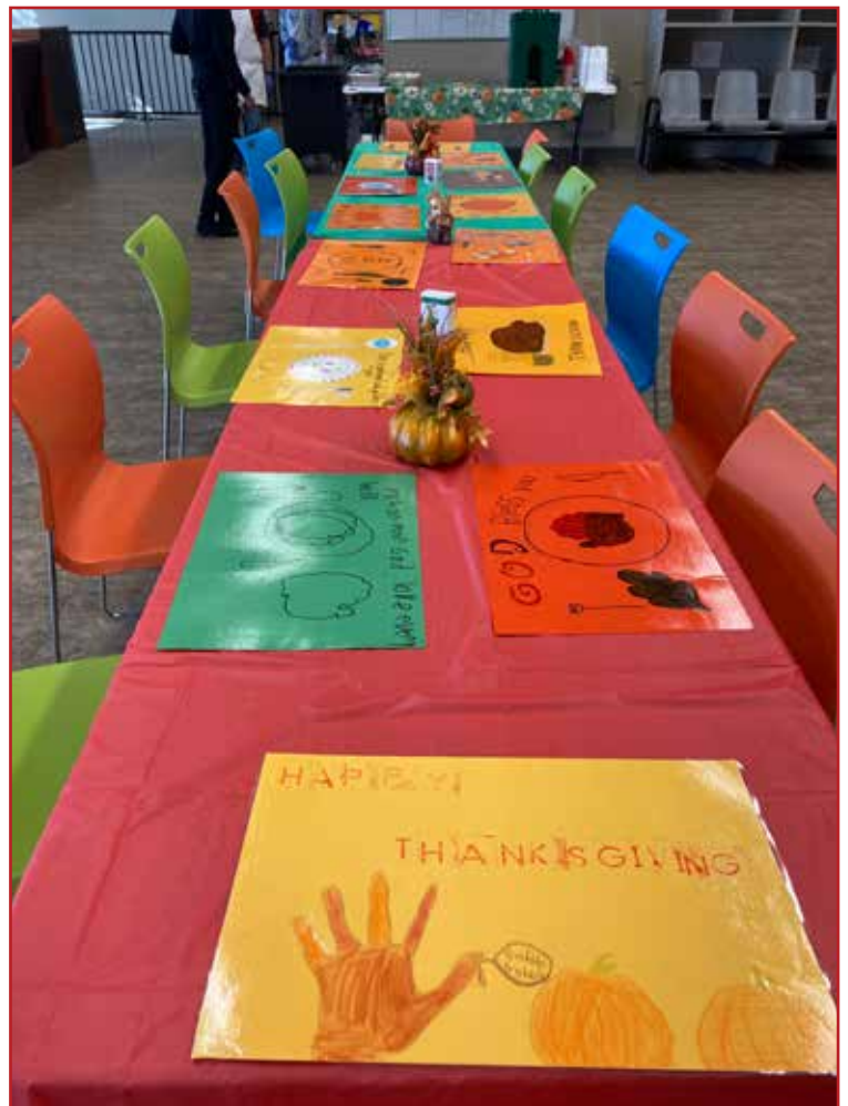
Thanksgiving community table with placemats made by the children of St. Nicholas School.

Moody Food Drive AT&T Field Tuesday, November 21, 2023